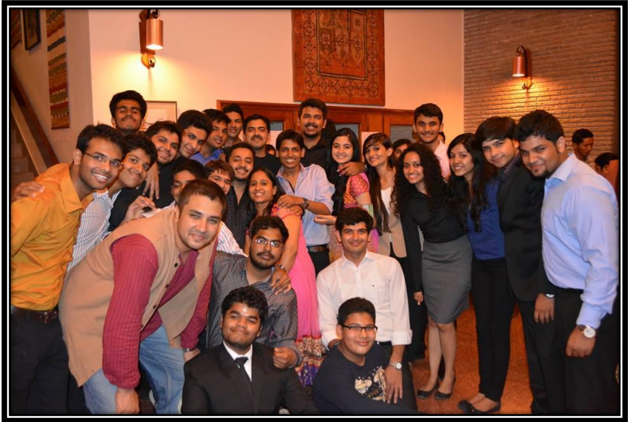
A moment during the formal night