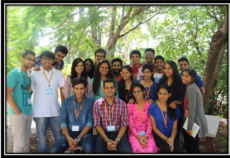
Smile is a true reflection of the soul (moment during the conference)

Our social life also plays an important role in our career. Only when we are emotionally stable will we be able to make correct decisions and successfully shoulder responsibilities. A healthy mind dwells in a healthy body. With good health by our side the journey towards a successful career remains constant with no untimely breaks due to chronic illness. Hence it is necessary that we start taking care of our health at an early age. As we enter our professional life we start earning and as years pass by we still keep on gathering wealth. We tend to forget the importance of sharing the wealth earned. So it is necessary that we also plan on contributing to the society and help the under-privileged. It is said that every individual must have three hobbies – one that will earn him money, one that will help him maintain good health and one that will give him peace of mind.