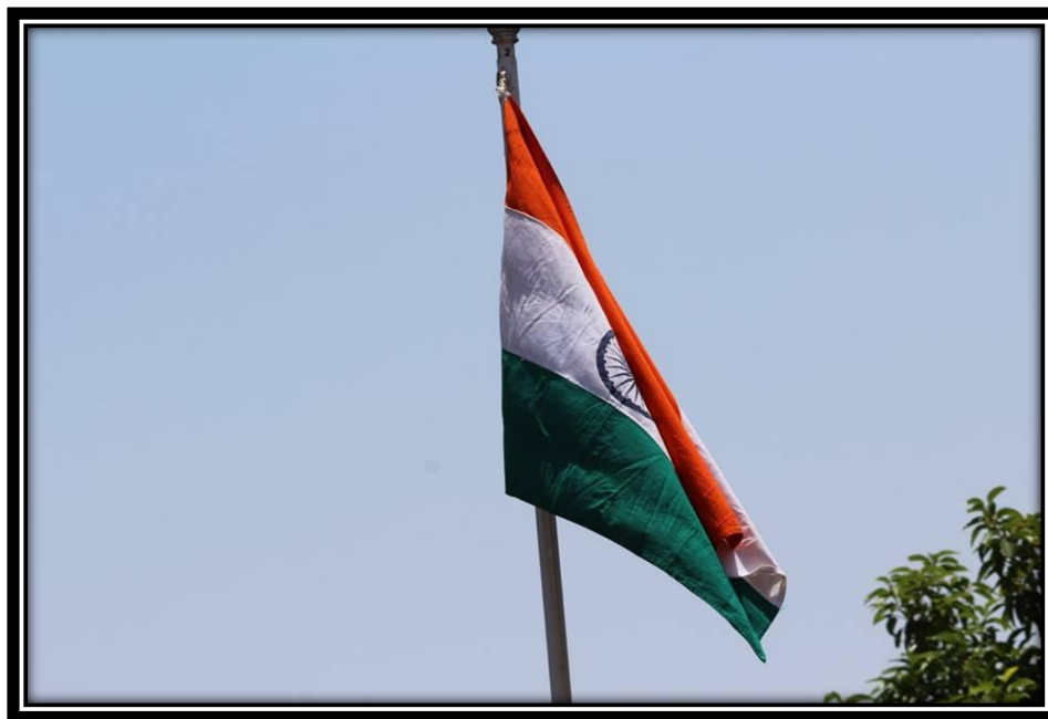
The sacred fabric that binds us together